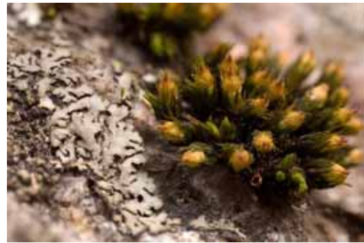
Phaeophyscia adiastrata hides in plain sight near Orthotrichum strangulatum in Franklin County.

The co-occurrence of lichen and mosses on rocks can sometimes go unnoticed because the lichen blends in so well. This is another instance of Phaeophyscia adiastrata on a boulder, alongside a tufted acrocarpous moss Orthotrichum strangulatum , a saxicolous member of a mainly corticolous genus.