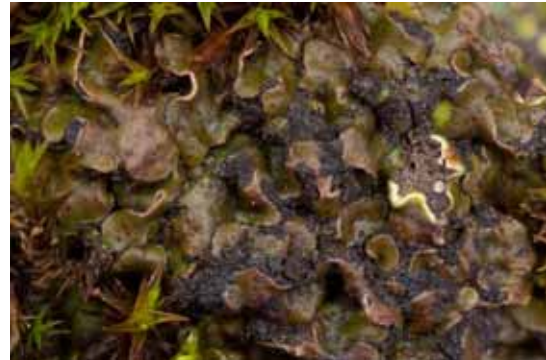
Placidium lachneum and Schistidium rivulare share the limestone limelight in Marion County.

alkaline soil in open areas. This substrate is also a good one for the dark, tufted moss Schistidium rivulare , an acrocarp that branches more than is typical, and thus approaches pleurocarpy in its growth form.