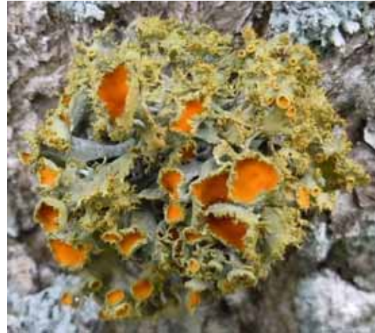
Teloschistes chrysophthalmus