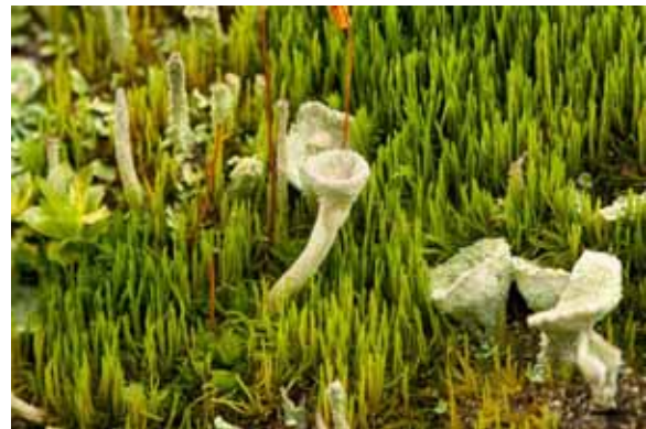
Dicranum flagellare and an unidentified pixie-cup lichen over in Marion County.

A group of confusingly similar ground-dwelling Cladonia lichens are those that produce upright goblet-shaped podetia. Like the reindeer lichens, these "pixie cups" are often mingled with soil acrocarpous mosses such as this Dicranum flagellare , a nifty species rendered distinctive by its profusion of fragile sword-like branches that break off to form new plants.