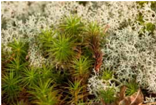
Polytrichum ohioense and Cladonia subtenuis stand their ground in Hocking County.

Bryophytes and lichens are "poikilohydric," meaning that they rely completely on the immediate environment for water. Accordingly they are capable of drying out for prolonged periods, only to rehydrate quickly when it rains or is dewy. This enables growth in intermittent bursts. Mosses and lichens can thereby thrive on what would otherwise be barren sites, i.e., ones so stressful that vascular plants cannot overwhelm these smaller, less competitive organisms