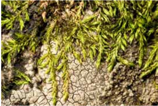
Endocarpon pallidum and Platygyrium repens in Franklin County, doing what “Paper” does in “Rock, Paper, Scissors.”

very inconspicuous, on siliceous boulders in woods. As such, it is likely to be sharing turf with a number of bryophytes, including, as shown below, a drab carpet moss so annoyingly common that we wish it would just stay on logs where it belongs, Platygyrium repens .