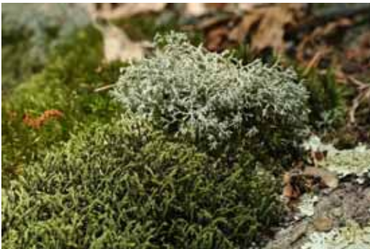
Cladonia subtenuis and Hedwigia ciliata, shoulder-to-shoulder atop a boulder in Gallia County.

The tops of rocks are prime real estate for organisms that don't have roots. Hedwigia ciliata is a very common moss with a fairly strict fidelity to acidic boulders in both sunny and shady spots. A sparsely-branched pleurocarp, Hedwigia grows in tufts that ape the reindeer lichens they often grow alongside.