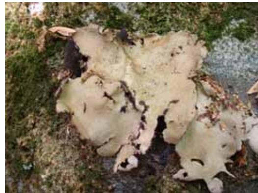
Fig. 1. Rock tripe found in its usual state.

these deluxe-sized lichens, it is truly a memorable sight. This interesting lichen is attached to vertical rock surfaces by means of a central holdfast which resembles the “outie” variety of a belly button (umbilicus). The upper surface of this large, leathery lichen is frequently lacerated along the rim and the upper cortex is usually found with a gray-brown to olive-brown color (as depicted in Fig. 1).