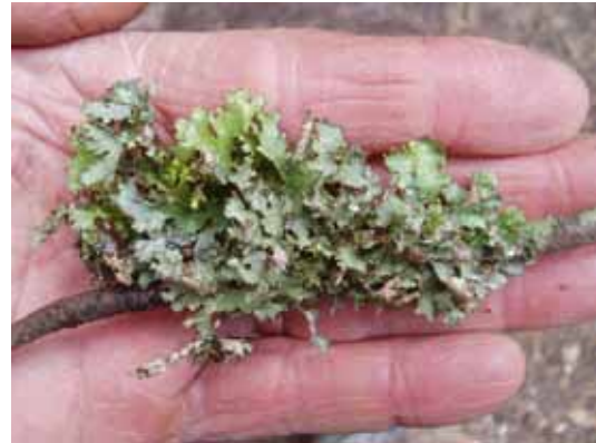
Tuckermanopsis americana .

fallen twigs and branches of hemlock trees.