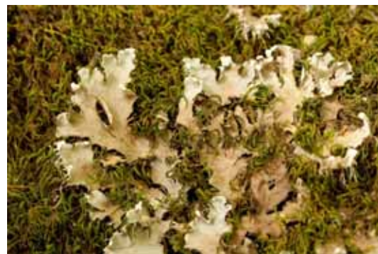
Peltigera canina and Anomodon attenuatus are lithic bedfellows in Meigs County.

The “pelts” (genus Peltigera ) are large, loosely attached lichens that have a cyanobacterial photobiont.