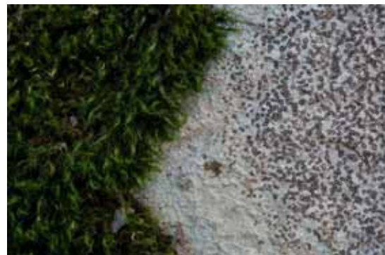
Porpidia albocaerulescens and Dicranum fulvum at a rock concert in Delaware County, Ohio.

Lichens, being generally less shade-tolerant than bryophytes, are correspondingly less frequent in wooded areas. Nonetheless, on hard substrates a few lichen species can gain a foothold. An intriguing crustose lichen, Porpidia albocaerulescens , is quite common on siliceous rocks, and so is often seen with mosses such as Hedwigia ciliata , and, as shown below, Dicranum fulvum .