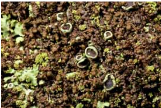
Phaeophyscia adiastrata and Frullania brittoniae growing on a boulder, boldly, in Miami County.

Phaeophyscia adiastrata is a very common small-lobed foliose lichen, one of a few that do well in the shade.