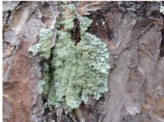
Imshaugia aleurites .

Imshaugia aleurites also strongly favors pine bark, usually on trunks rather than twigs. However it is also occasionally seen on the hard, acidic bark of oaks and on dead wood. This is a medium sized light gray foliose lichen with numerous fine isidia massing towards the center of the thallus.