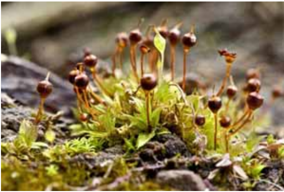
Physcomitrium collenchymatum “studio” taken October 31, 2011 (one day after its collection from Battelle Darby Metro Park, Franklin County, Ohio).

Seligeria recurvata . The second, non-ephemeral, half of the Battelle Darby trip was an examination of a wooded ravine, one of several that run perpendicular to, and intermittently drain into, Little Darby Creek. Scattered about the low ground of the ravine near the creek are some medium-sized rocks, a few of which had gregarious but not tufted colonies of a tiny few-leaved acrocarp, many bearing immature “spear-stage” sporophytes. There were also a few mature sporophytes, perhaps persistent from the previous year, with distinctive subcylindric capsules. The seta were remarkably curved (“cygneous”), so we called it “horse-hair” moss as Jeff scraped several of the wee plants into an envelope. “Horse-hair” turned out to be Ohio’s 2 nd county record for Seligeria recurvata (Seligeriaceae). (The other, also a specimen, is from Adams.) Crum and Anderson (1981) explain this moss is found “on moist shaded cliffs and boulders, favoring sandstone rather than calcareous substrates.”