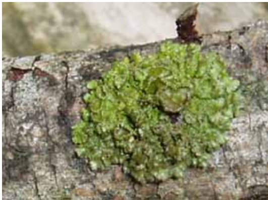
Tuckermanella fendleri (wet).

Two others, Tuckermanopsis americana and T. ciliaris are also near obligate pine dwellers. I have seen these very rarely on the hard, acidic bark of chestnut oak. These nearly identical species are separated by chemistry. Both are medium sized brown-green foliose lichens. They usually have marginal pycnidia and frequently have marginal apothecia. I have also seen these on the