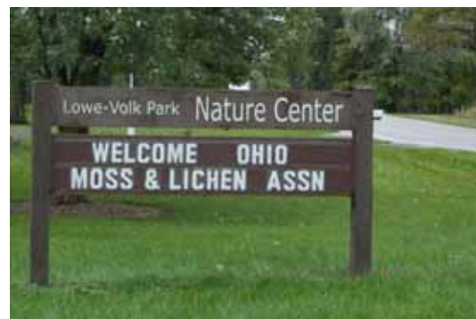
OMLA received a warm welcome!