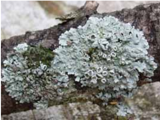
Imshaugia placorodia and Tuckermanella fendleri (dry).

a very small foliose lichen – fingernail sized at most. It is a dark, green-brown color when dry, but bright green when wet. It has toothed margins and usually numerous, large apothecia. This also grows exclusively on pine twigs where it is sometimes hard to spot due to its dark color.