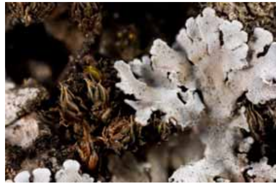
Physconia leucoleiptes and Syntrichia papillosa barking up the right tree in Franklin County.

Here, P. leucoleiptes is seen alongside an intriguing short-stemmed, broad-leaved acrocarpous moss, Syntrichia papillosa , that reproduces exclusively by means of minute globose asexual gemmae produced along the upper leaf surface. (The gemmae are not evident in the photo because the moss is in its dried-up state, with leaves clinging tightly to the stem.)