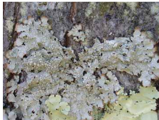
Punctelia subrudecta is now called P. caseana .

All of the samples of Punctelia perreticulata studied have lightly pruinose lobe tips (absent in P. caseana ) as well as the ridged upper surface.