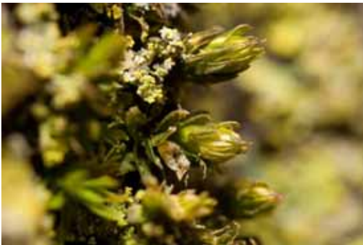
Candelaria concolor and Orthotrichum pusillum , a corticolous combo, in Miami County.

One of the most common lichens found high on the bark of trees, even in urban areas, is a tiny but profuse, bright yellow foliose one, Candelaria concolor . A common high-bark moss genus is Orthotrichum (various species, obnoxiously difficult to tell apart). Candelaria and Orthotrichum often grow together.