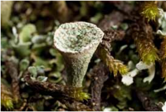
Cladonia pyxidata and Bryoandersonia illecebra hold up a bank in Delaware County.

The tops of rocks are prime real estate for organisms that don't have roots. Hedwigia ciliata is a very common moss with a fairly strict fidelity to acidic boulders in both sunny and shady spots. A sparsely-branched pleurocarp, Hedwigia grows in tufts that ape the reindeer lichens they often grow alongside.