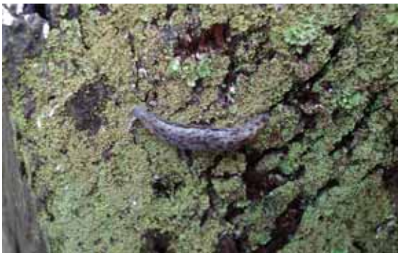
Leopard slugs, like the one pictured here, sometimes graze on lichens.