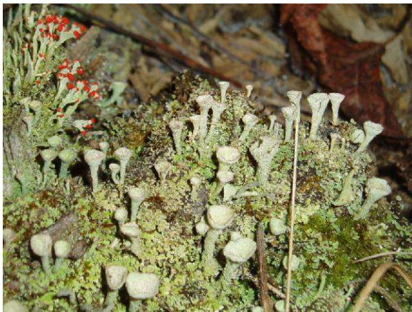
Cladonia cristatella (British Soldier) Cladonia grayi (Pixie Cup) lichens.